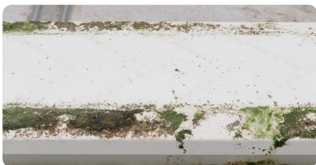
Before Intra Clean Minerals